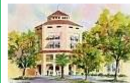
Alachua Public Library USA.