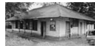
Shagamu Public Library, Ogun State Nigeria.

The academic, public, school, and special libraries are different types of books depositories existing today in our modern society. Our focus begins with public libraries. The conditions and numbers of public libraries in Nigeria are deplorable. The Federal, State and Local Government do not fund them adequately. A few local philanthropists are pitching in and some groups from overseas have seen the dilapidated state of their regional libraries and they are gearing efforts to redeem them. These efforts are commendable, but they are not sustaining. The situation is like giving a hand out to homeless man. No amount of handout can change his/her situation without new orientation. We cannot continue in the current circle of provision and expect a change for public libraries. There must be a new approach to the appalling state. It is therefore very important to get, the stronger attention of the Federal government, the senate and the legislative branch pass a bill that will regularly fund and the establishment of public libraries across the nation. Each state and local government should be encouraged to do more. As a national body we would encourage better public support for the libraries. Friends of libraries Nigeria Chapter believes that the effort to accomplish this